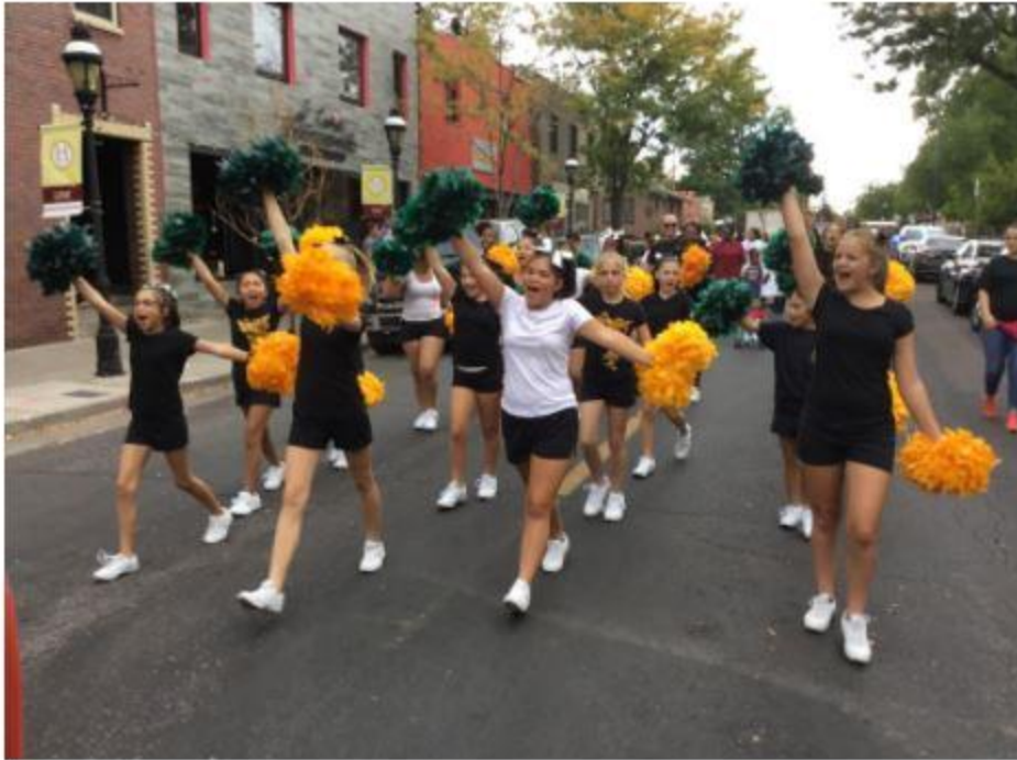
North high school cheerleaders