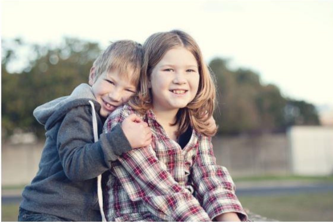
Little boy hugging his older sister