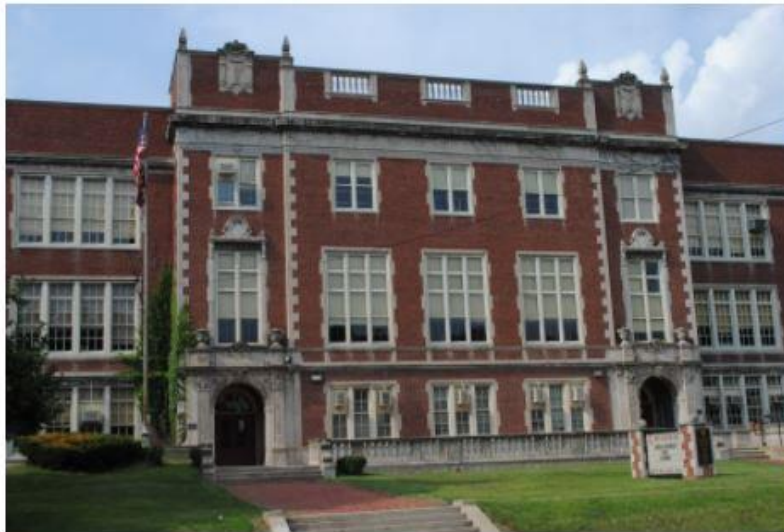
North High School

The North High Homecoming week is one of the biggest weeks in all of north's history. In the Homecoming week activities range from going to the parade, or participating in the north colors day. This year, in the north high parade, we had way too many floats! The floats ranged from the freshmen vikings boat (where they packed as many of the freshmen as they could onto the float) to the class of 44', and even the cheerleader masquerade float! This year, the community came together, and held all colors high and proud. There were many different elementary schools that were in the parade too, such as Sandoval, Brown, and even Valdez. There were also many different groups too, of the different classes back then. Such as the class of '55 and of '44. The parade was following JROTC, while they were marching in the front, while the football team was in the front, in a army truck. The cheerleaders took charge of the whole "Masquerade" theme, and built an entire float, wore masks, and did what they do best, cheer! The Skinner cheerleaders cheered with the parade too, and rapped the Skinner colors. On north colors day, North high school held a pep rally, and all students were decked out in purple and yellow. They had an assembly in the auditorium, were out of nowhere, they had an ice cream eating competition. Throughout all the chaos, North held its colors high and proud, and showed what we can accomplish if the community comes together.